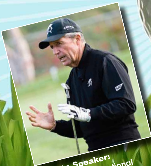
Keynote Speaker: Gary Player, International Ambassador of Golf